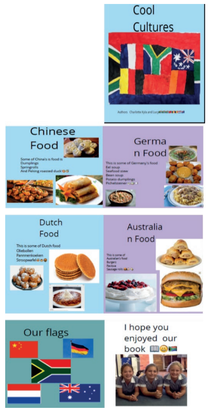
Figure 6. An example of one of the learner-created e-books.

Lots of them experimenting with colour background for pages – kids moving around and looking at others' work. Lexi takes pics - iPad's camera – saves them & changes size and layout in eBook.