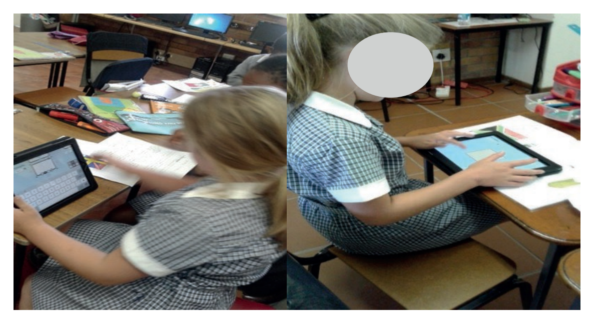
Figure 2. Motivated, staying on task.

This ease representing ideas on their iPads suggested that pupils took responsibility for tasks, and grew in confidence and independence: