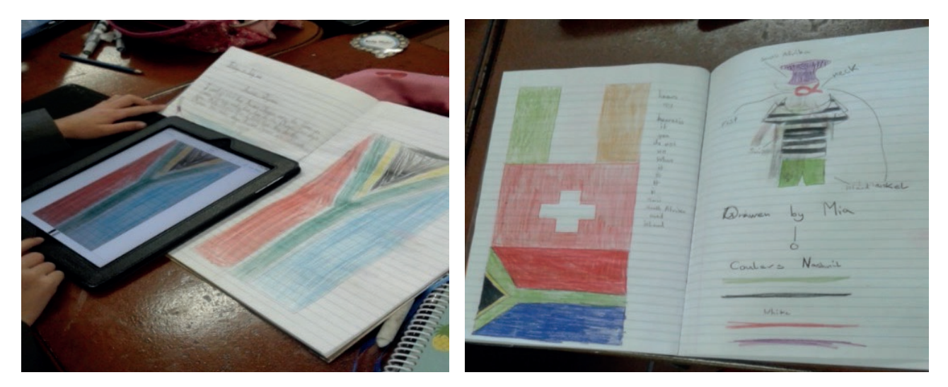
Figure 5. Multimedia texts produced using technologies other than ICTs.