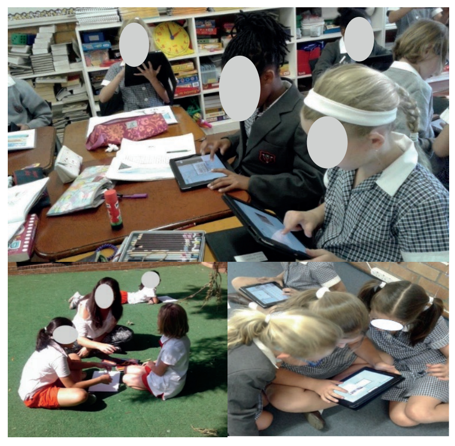
Figure 4. Flexible work across multiple spaces.