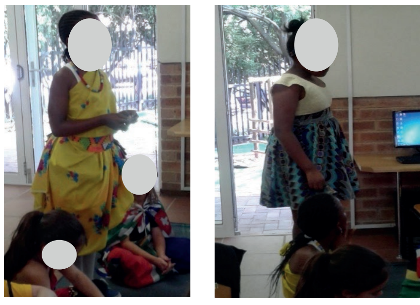
Figure 3. Heritage day.