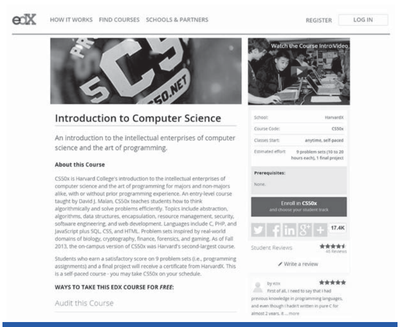
Figure 2. Screenshot of an HarvardX course presentation.

and agents (subjects) within clauses. Declarative or epistemic clauses, which denote the stating of facts, are different from interrogative or obligational clauses which denote, respectively, a question and a normative expectation. As an example, consider how certain processes in the mainstream political discourse are systematically construed through a very subtle use of modality and grammar. Statement such as "the modern world is swept by change" (Fairclough, 2003, p.13) are represented as "unmodalized" truths where agents and historical conditions are conveniently absent from the text. The result is that specific linguistic choices and omissions act as primers for the remainder of the text, as they ease shifts from declarative to obligational